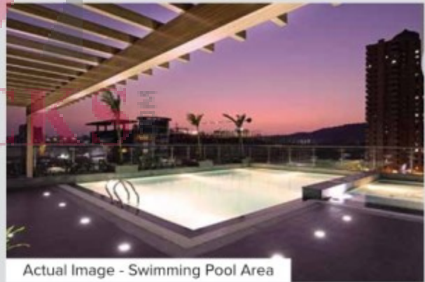
Actual Image - Swimming Pool Area