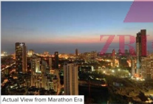
Actual View from Marathon Era

Amenities: Grand Entrance Lobby with Drop-Off Area | State-of-the-art Gymnasium | Kids' Play Area | Yoga & Meditation Area | Multipurpose Sports Court | Internal Capsule Elevator inside the Penthouse on the 35 th Floor | Swimming Pool Scenic Views of Mahalaxmi Racecourse & Arabian Sea