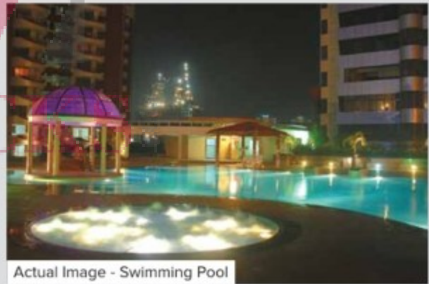
Actual Image - Swimming Pool