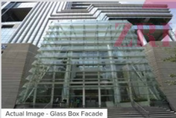
Actual Image - Glass Box Facade

Amenities: Multi-level Car Park | Triple-Height Entrance Lobby | Approx. 14 ft floor to ceiling height | Column span of 32 ft to 54 ft for more usable area | Multiple High-Speed Elevators | Glazed Façade | Beautiful Views | Sky Gardens | Solar Envelope Design