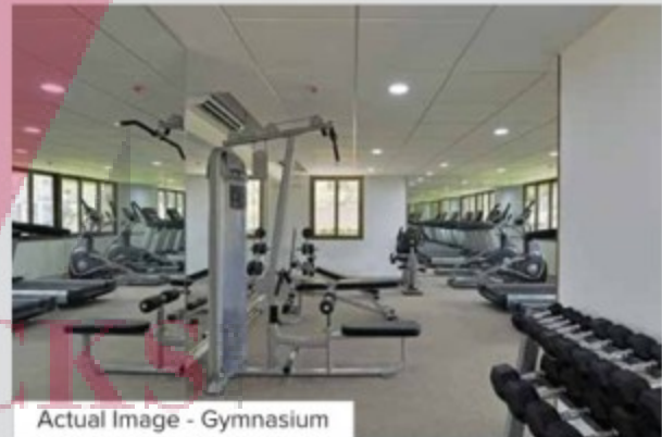
Actual Image - Gymnasium