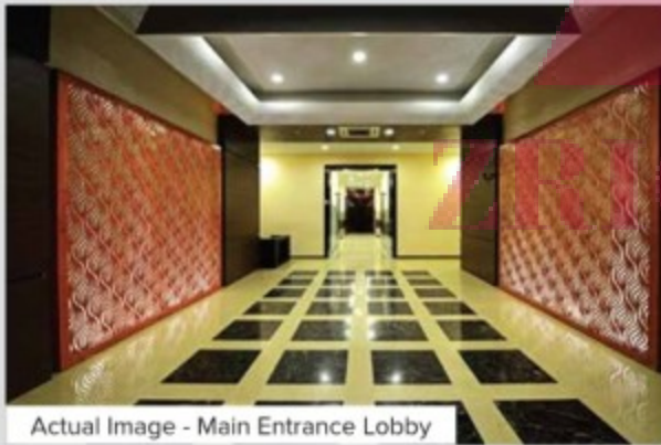
Actual Image - Main Entrance Lobby

Amenities: Landscaped Garden | Clubhouse with Gymnasium | Swimming Pool on the 6 th level | Kid's Play Area | High Speed Elevators with well-instated security system | Multi-level Car Park | Earthquake Resistant Structure | Innovative Design | 180 degree Scenic View from the apartments