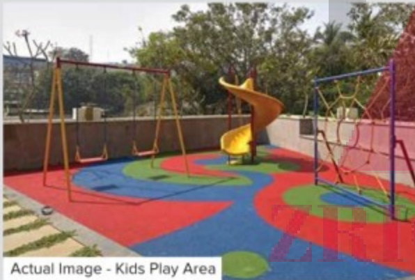
Actual Image - Kids Play Area